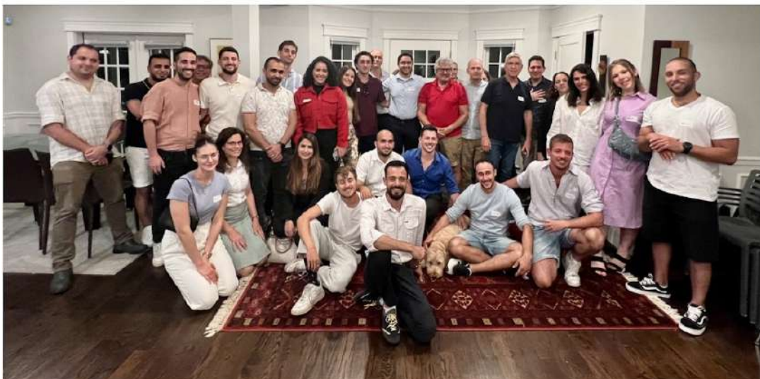
A recent Convisero gathering; Israeli Arab and Jewish citizens with Palestinian peers of 50/50, a joint entrepreneurial initiative in my home (August 2023).

I want us to nurture an interactive, intergenerational network able to support you in your studies, activities, and careers. And, I want us to continue to create distinctive collaborations, ever more capable of confronting your and the world's challenges.